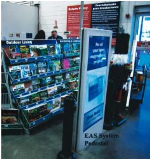
FIGURE 5. Magazine rack juxtaposed to the electronic article surveillance (EAS) pedestal at a large commercial retail home improvement store. Note that the EAS system pedestal is “camouflaged” with advertising, potentially decreasing awareness of the electromagnetic interference source. Browsing magazines in display may result in customers with implantable devices lingering around the EAS pedestal.