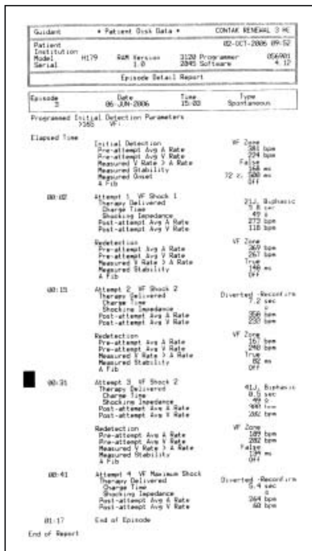
FIGURE 2. Episode detail report from the implantable cardioverter defibrillator after exposure to the electronic article surveillance system. Note the relatively brief duration of the episode leading up to the second shock (41 seconds), suggesting that prolonged exposure is not required to cause device dysfunction.