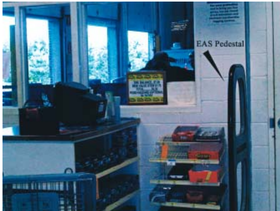
FIGURE 1. Checkout area of the automotive section of a large commercial retail store. Note the proximity (38 in) of the counter to the electronic article surveillance (EAS) system pedestal. Customers face away from the EAS system pedestal, decreasing potential awareness of their proximity to the EAS system. Also note placement of the candy rack, which provides an impulse buying opportunity that potentially places the person with an implantable cardiac device in harm's way.