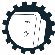
Confirmation of Deactivation