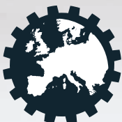
Designed and manufactured in Europe