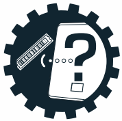
Double Checker Mode